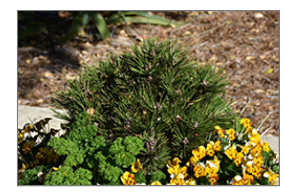
Banderica Bosnian Pine