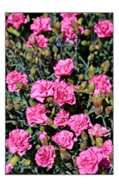
Pretty Poppers Double Bubble Pinks flowers

Dramatic, bubblegum pink flowers above mounds of fine blue-green foliage really get attention; great for flower arrangements; deadhead to rebloom; pair up with summer blooming perennials and annuals to time a continued flower display