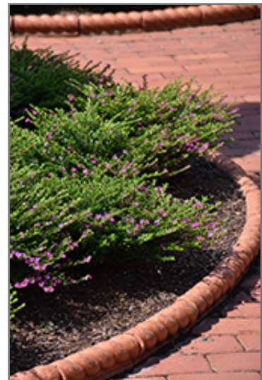
FloriGlory Diana Mexican Heather in bloom