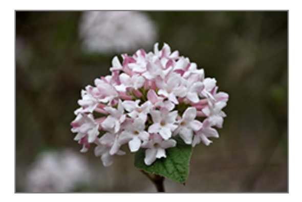
Spice Baby Koreanspice Viburnum flowers