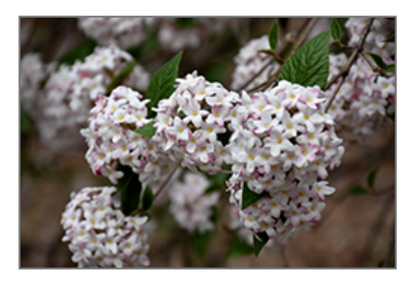
Spice Baby Koreanspice Viburnum flowers

Spice Baby Koreanspice Viburnum is a dense multi-stemmed deciduous shrub with an upright spreading habit of growth. Its average texture blends into the landscape, but can be balanced by one or two finer or coarser trees or shrubs for an effective composition.