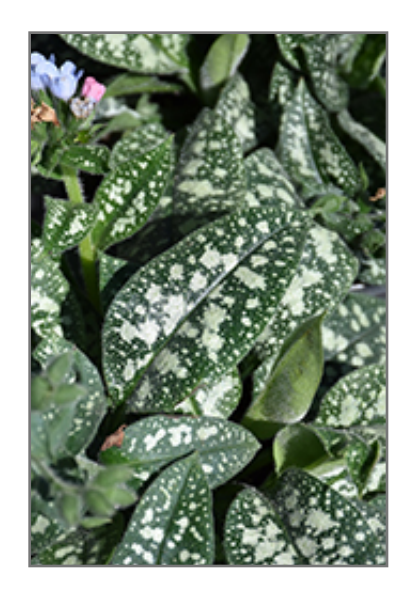
Twinkle Toes Lungwort foliage

315 Coleman Road McDonald, PA 15057 (724) 926-2541