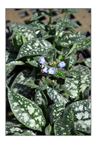
Twinkle Toes Lungwort flowers

Twinkle Toes Lungwort is recommended for the following landscape applications;