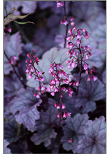
Pink Panther Coral Bells flowers

Pink Panther Coral Bells is a fine choice for the garden, but it is also a good selection for planting in outdoor pots and containers. With its upright habit of growth, it is best suited for use as a 'thriller' in the 'spiller-thriller-filler' container combination; plant it near the center of the pot, surrounded by smaller plants and those that spill over the edges. Note that when growing plants in outdoor containers and baskets, they may require more frequent waterings than they would in the yard or garden.