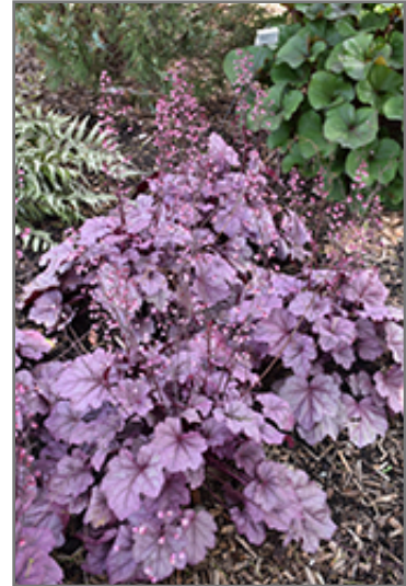
Pink Panther Coral Bells in bloom

Pink Panther Coral Bells is recommended for the following landscape applications;