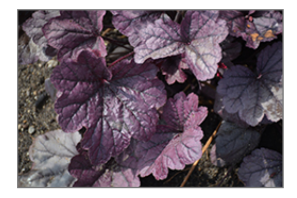
Grape Timeless Coral Bells foliage

315 Coleman Road McDonald, PA 15057 (724) 926-2541