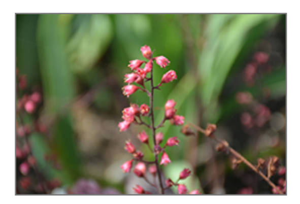
Grape Timeless Coral Bells flowers

Grape Timeless Coral Bells will grow to be about 10 inches tall at maturity extending to 20 inches tall with the flowers, with a spread of 20 inches. When grown in masses or used as a bedding plant, individual plants should be spaced approximately 16 inches apart. Its foliage tends to remain low and dense right to the ground. It grows at a medium rate, and under ideal conditions can be expected to live for approximately 10 years. As an evegreen perennial, this plant will typically keep its form and foliage year-round.