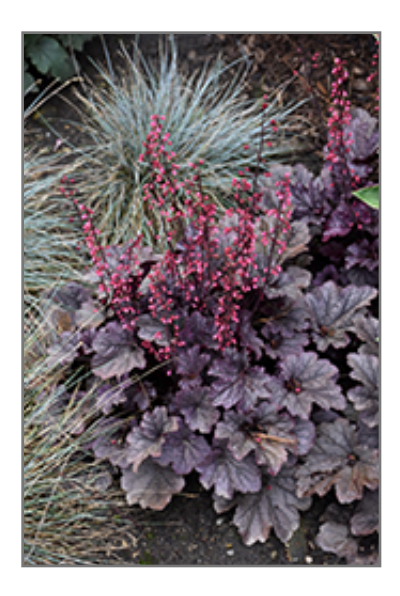
Grape Timeless Coral Bells in bloom

This is a relatively low maintenance plant, and should be cut back in late fall in preparation for winter. It is a good choice for attracting butterflies and hummingbirds to your yard. It has no significant negative characteristics.