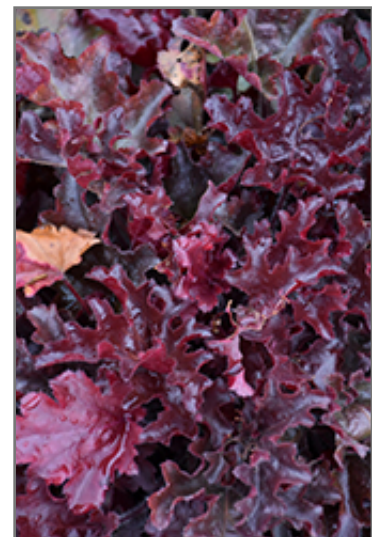
Dolce Cherry Truffles Coral Bells foliage