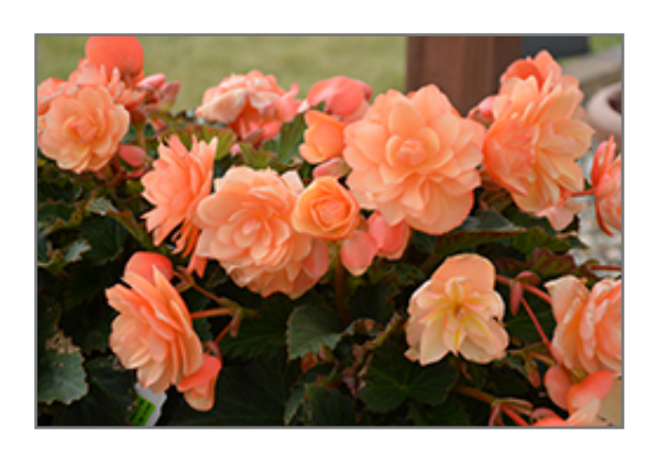
Fragrant Falls Peach Begonia flowers

This is a high maintenance plant that will require regular care and upkeep, and usually looks its best without pruning, although it will tolerate pruning. Deer don't particularly care for this plant and will usually leave it alone in favor of tastier treats. Gardeners should be aware of the following characteristic(s) that may warrant special consideration;