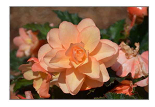
Fragrant Falls Peach Begonia flowers

Fragrant Falls Peach Begonia is an herbaceous annual with a trailing habit of growth, eventually spilling over the edges of hanging baskets and containers. Its medium texture blends into the garden, but can always be balanced by a couple of finer or coarser plants for an effective composition.