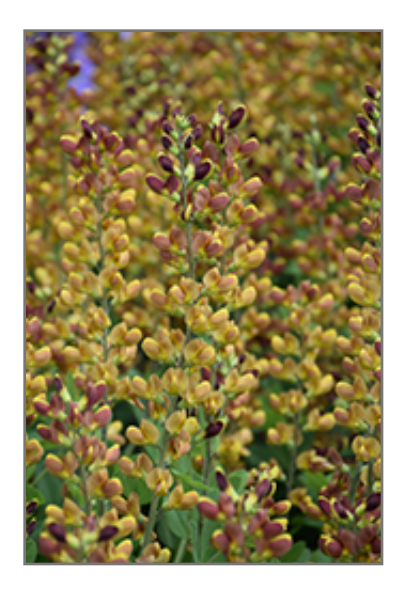
Decadence Cherries Jubilee False Indigo flowers

Decadence Cherries Jubilee False Indigo is an herbaceous perennial with an upright spreading habit of growth. Its medium texture blends into the garden, but can always be balanced by a couple of finer or coarser plants for an effective composition.