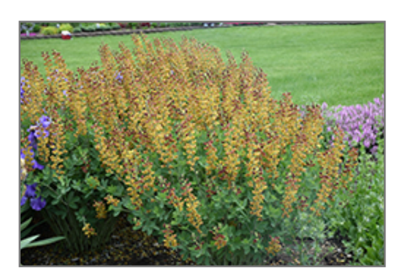
Decadence Cherries Jubilee False Indigo in bloom