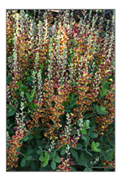
Decadence Cherries Jubilee False Indigo flowers

Decadence Cherries Jubilee False Indigo will grow to be about 28 inches tall at maturity, with a spread of 3 feet. It tends to be leggy, with a typical clearance of 1 foot from the ground, and should be underplanted with lower-growing perennials. It grows at a slow rate, and under ideal conditions can be expected to live for approximately 25 years. As an herbaceous perennial, this plant will usually die back to the crown each winter, and will regrow from the base each spring. Be careful not to disturb the crown in late winter when it may not be readily seen!