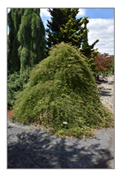
Emerald Lace Japanese Maple

315 Coleman Road McDonald, PA 15057 (724) 926-2541