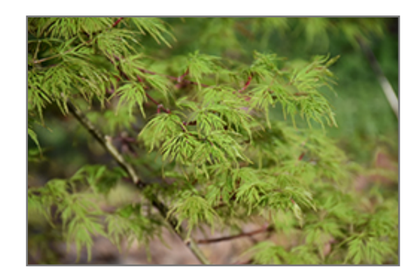
Emerald Lace Japanese Maple foliage