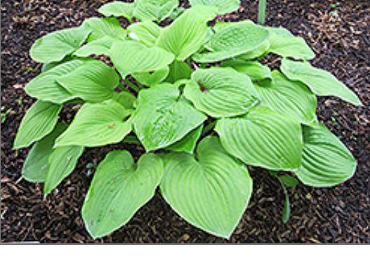
August Moon Hosta