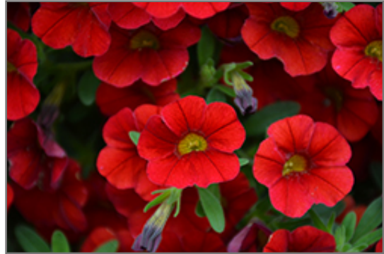
MiniFamous Neo Vampire Calibrachoa flowers

MiniFamous Neo Vampire Calibrachoa is a dense herbaceous annual with a trailing habit of growth, eventually spilling over the edges of hanging baskets and containers. Its medium texture blends into the garden, but can always be balanced by a couple of finer or coarser plants for an effective composition.