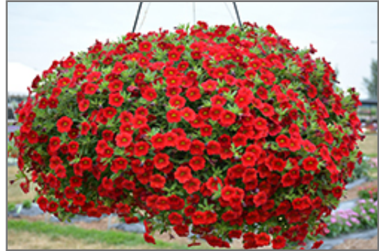
MiniFamous Neo Vampire Calibrachoa in bloom