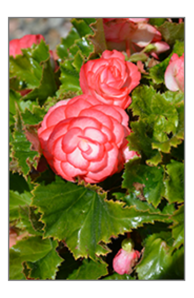
On Top Fandango Begonia flowers

This is a high maintenance plant that will require regular care and upkeep, and usually looks its best without pruning, although it will tolerate pruning. Deer don't particularly care for this plant and will usually leave it alone in favor of tastier treats. Gardeners should be aware of the following characteristic(s) that may warrant special consideration;