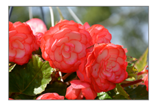
On Top Fandango Begonia flowers