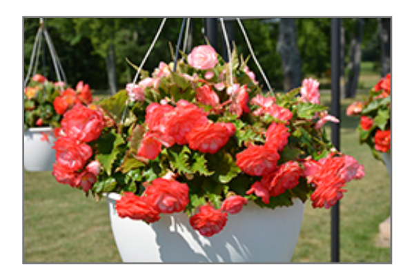
On Top Fandango Begonia in bloom

On Top Fandango Begonia will grow to be about 12 inches tall at maturity, with a spread of 12 inches. When grown in masses or used as a bedding plant, individual plants should be spaced approximately 10 inches apart. Its foliage tends to remain dense right to the ground, not requiring facer plants in front. Although it's not a true annual, this plant can be expected to behave as an annual in our climate if left outdoors over the winter, usually needing replacement the following year. As such, gardeners should take into consideration that it will perform differently than it would in its native habitat.