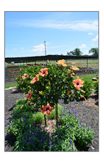
Fiesta Hibiscus (topiary form)

Fiesta Hibiscus is a fine choice for the garden, but it is also a good selection for planting in outdoor pots and containers. With its upright habit of growth, it is best suited for use as a 'thriller' in the 'spiller-thriller-filler' container combination; plant it near the center of the pot, surrounded by smaller plants and those that spill over the edges. It is even sizeable enough that it can be grown alone in a suitable container. Note that when growing plants in outdoor containers and baskets, they may require more frequent waterings than they would in the yard or garden.