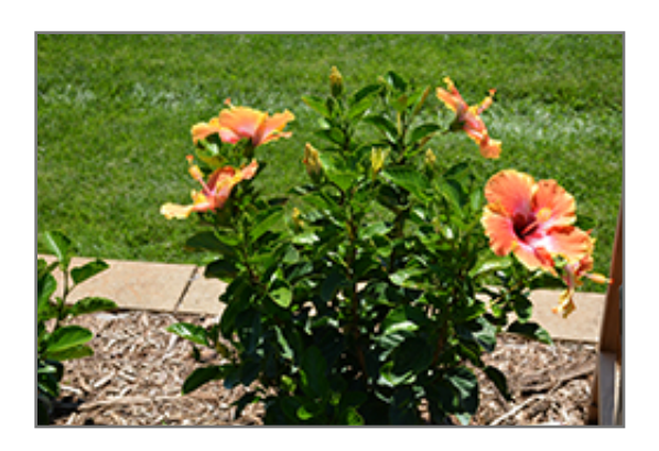
Fiesta Hibiscus in bloom