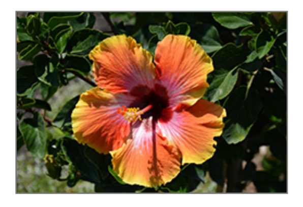
Fiesta Hibiscus flowers

This plant is native to the tropics and prefers growing in moist environments with evenly warm conditions all year round. In our climate, it is usually grown as an outdoor annual in the garden or in a container. If you want it to survive the winter, it can be brought in to the house and provided with special care, and then returned to the garden the following season. In its preferred tropical habitat, it can grow to be around 8 feet tall at maturity, with a spread of 6 feet. However, when grown as an annual or when overwintered indoors, it can be expected to perform differently, and its exact height and spread will depend on many factors; you may wish to consult with our experts as to how it might perform in your specific application and growing conditions.