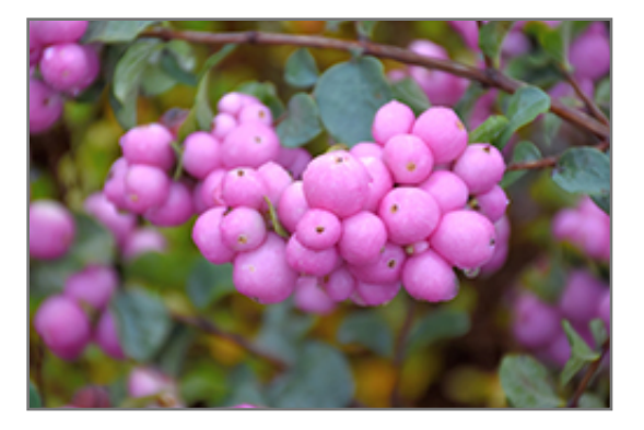
Proud Berry Coralberry fruit

A rugged spreading shrub that produces small white to pink flowers in summer followed by bright shell pink berries with a white blush along arching branches in fall, great for cut flower arrangements