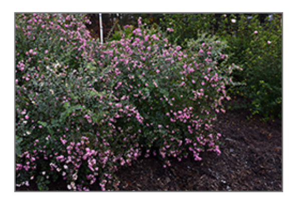
Proud Berry Coralberry fruit

This shrub will require occasional maintenance and upkeep, and can be pruned at anytime. It is a good choice for attracting birds to your yard, but is not particularly attractive to deer who tend to leave it alone in favor of tastier treats. Gardeners should be aware of the following characteristic(s) that may warrant special consideration;