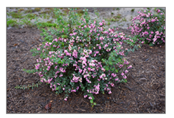
Proud Berry Coralberry fruit

Proud Berry Coralberry will grow to be about 5 feet tall at maturity, with a spread of 5 feet. It tends to fill out right to the ground and therefore doesn't necessarily require facer plants in front, and is suitable for planting under power lines. It grows at a fast rate, and under ideal conditions can be expected to live for approximately 15 years.