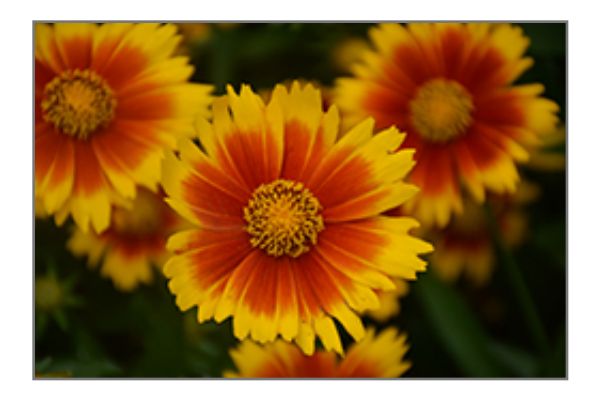
UpTick Gold and Bronze Tickseed flowers

A tidy, mounded variety, covered with striking, daisy-like yellow flowers with gold eyes and contrasting deep red-purple rings; tolerant of pests and drier soils; thriving in sandy and rocky soils; great as edging, or in containers; needs good drainage