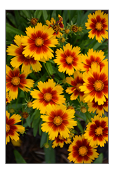
UpTick Gold and Bronze Tickseed flowers

This is a relatively low maintenance plant, and is best cleaned up in early spring before it resumes active growth for the season. It is a good choice for attracting bees and butterflies to your yard, but is not particularly attractive to deer who tend to leave it alone in favor of tastier treats. It has no significant negative characteristics.