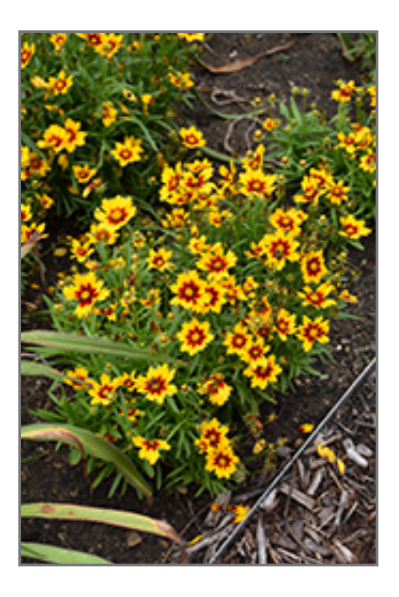
UpTick Gold and Bronze Tickseed in bloom

UpTick Gold and Bronze Tickseed is a fine choice for the garden, but it is also a good selection for planting in outdoor pots and containers. It is often used as a 'filler' in the 'spiller-thriller-filler' container combination, providing a mass of flowers against which the thriller plants stand out. Note that when growing plants in outdoor containers and baskets, they may require more frequent waterings than they would in the yard or garden.