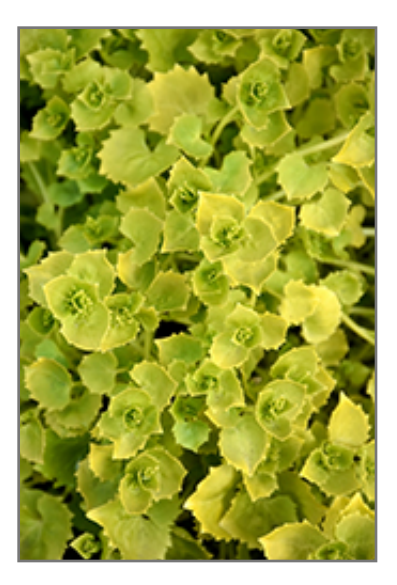
Dickson's Gold Italian Bellflower foliage