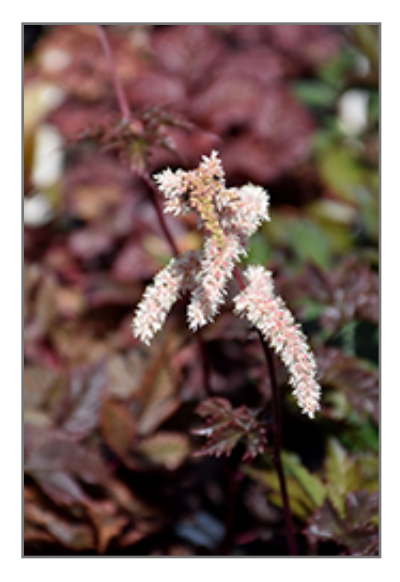
Chocolate Shogun Astilbe flowers

315 Coleman Road McDonald, PA 15057 (724) 926-2541