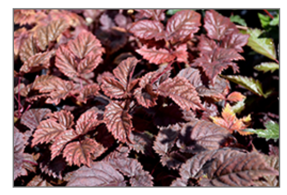
Chocolate Shogun Astilbe foliage