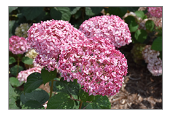
Invincibelle Spirit II Hydrangea flowers

Invincibelle Spirit II Hydrangea is a multi-stemmed deciduous shrub with a more or less rounded form. Its strikingly bold and coarse texture can be very effective in a balanced landscape composition.