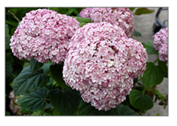
Invincibelle Spirit II Hydrangea flowers

This shrub will require occasional maintenance and upkeep, and is best pruned in late winter once the threat of extreme cold has passed. It has no significant negative characteristics.