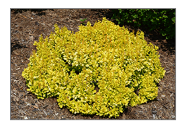
Sunjoy Mini Saffron Japanese Barberry

Sunjoy Mini Saffron Japanese Barberry is recommended for the following landscape applications;