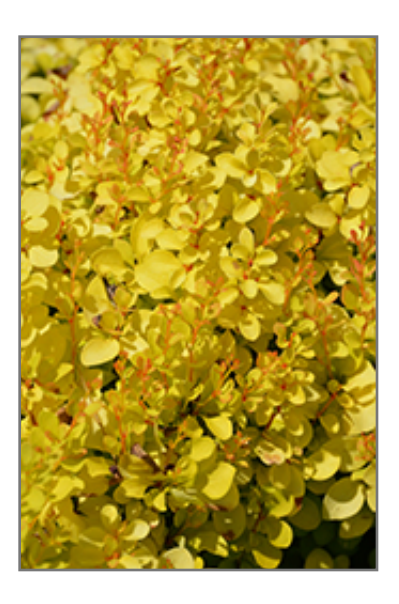
Sunjoy Mini Saffron Japanese Barberry foliage