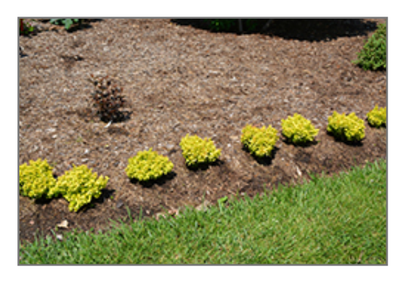
Sunjoy Mini Saffron Japanese Barberry (pruned as hedge)