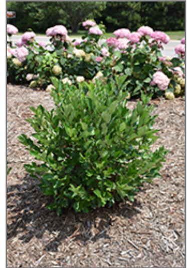
Low Scape Hedger Aronia