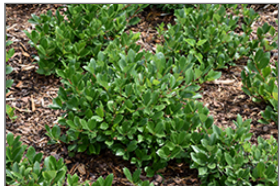
Low Scape Hedger Aronia