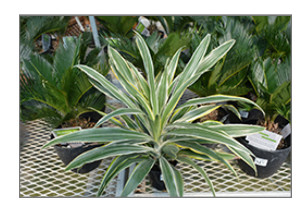
Warneckii Dracaena

A popular indoor plant that is easy to grow and care for; produces elegant sword shaped leaves with chartreuse variegation and white stripes; can be used as a tabletop or floor plant; tolerates low light areas