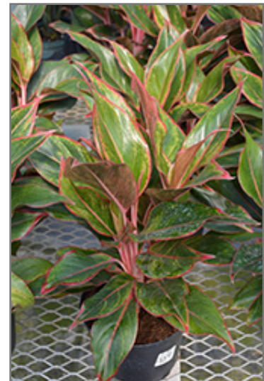
Siam Aurora Chinese Evergreen in full