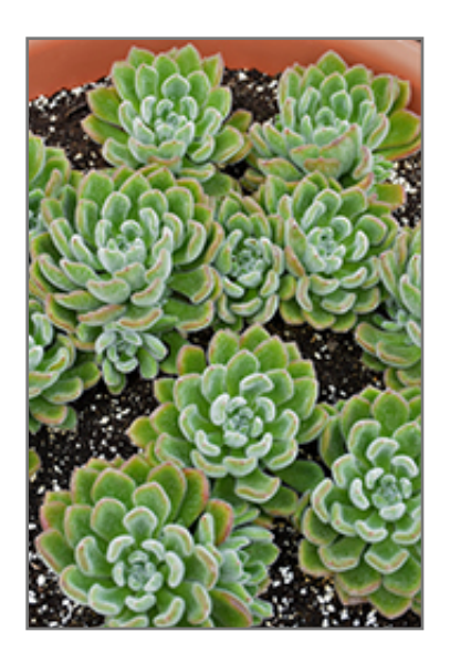
Mexican Fire Cracker

This is a dense herbaceous evergreen houseplant with tall flower stalks held atop a low mound of foliage. Its relatively fine texture sets it apart from other indoor plants with less refined foliage. This plant should not require much pruning, except when necessary to keep it looking its best.