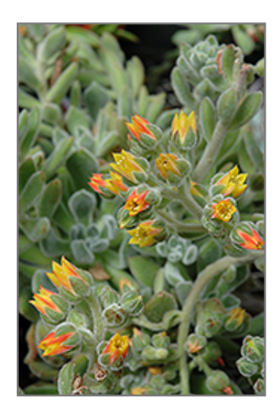
Mexican Fire Cracker flowers