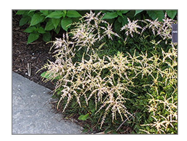
Sprite Astilbe in bloom