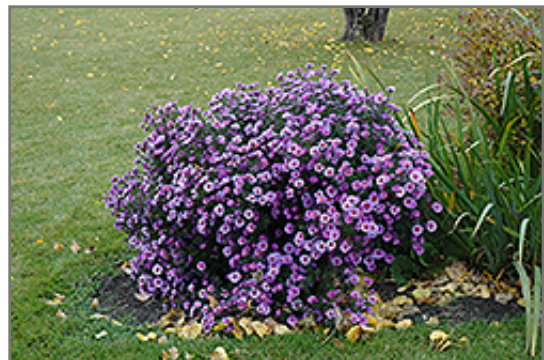
Purple Dome Aster in bloom