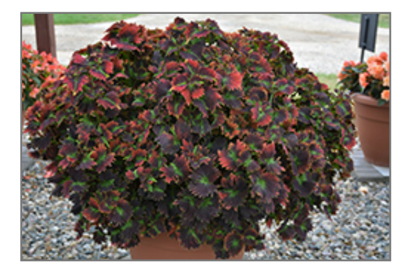
Stained Glassworks Tilt A Whirl Coleus

Stained Glassworks Tilt A Whirl Coleus is recommended for the following landscape applications;