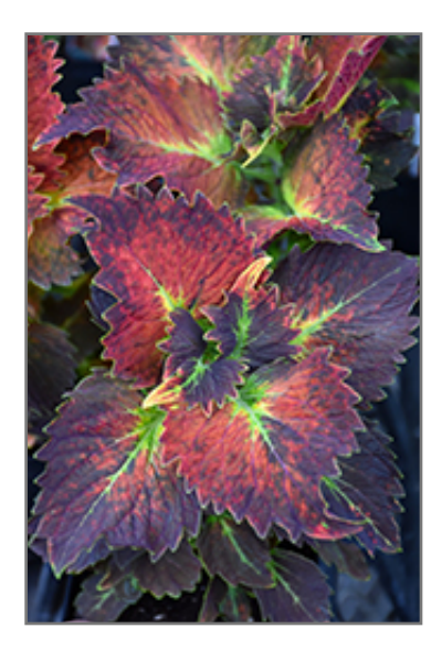
Stained Glassworks Tilt A Whirl Coleus foliage

This is a relatively low maintenance plant. The flowers of this plant may actually detract from its ornamental features, so they can be removed as they appear. Deer don't particularly care for this plant and will usually leave it alone in favor of tastier treats. It has no significant negative characteristics.