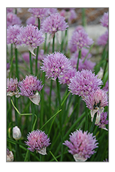
Chives flowers