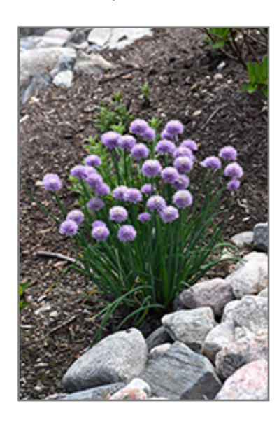
Chives in bloom