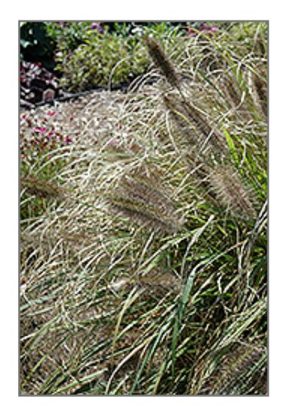
Ginger Love Fountain Grass foliage

315 Coleman Road McDonald, PA 15057 (724) 926-2541