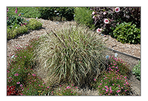
Ginger Love Fountain Grass