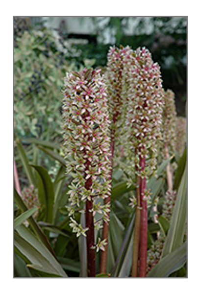
Sparkling Burgundy Pineapple Lily flowers

This stunning variety produces rosettes of long burgundy leaves that mature to olive, then turn back after flowering; spikes of attractive creamy-pink flowers with lavender tones rise up in late spring; lift in colder climates, mulch in milder ones