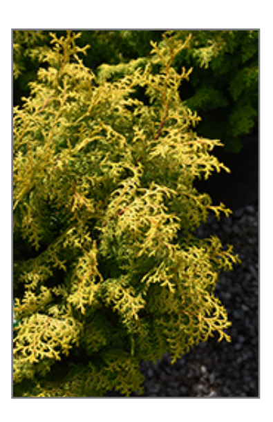
Melody Hinoki Falsecypress foliage

Melody Hinoki Falsecypress is a dwarf conifer which is primarily valued in the landscape or garden for its rigidly columnar form. It has attractive light green-variegated lemon yellow foliage. The twisted scale-like sprays of foliage are highly ornamental and remain lemon yellow throughout the winter.