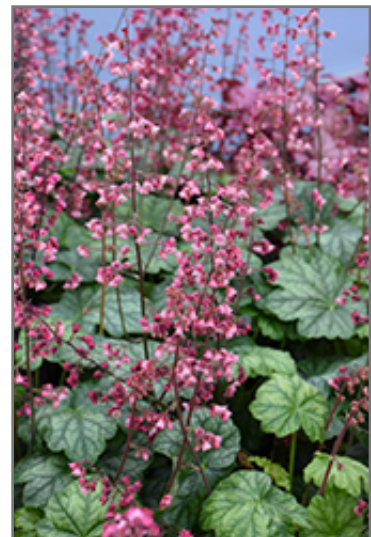
Berry Timeless Coral Bells flowers