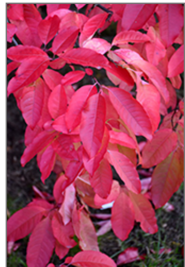
Sourwood in fall