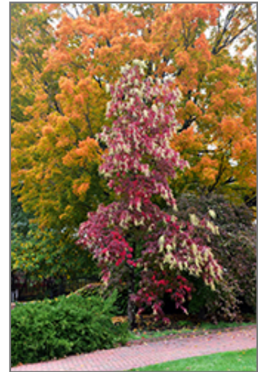
Sourwood in fall

This tree does best in full sun to partial shade. It does best in average to evenly moist conditions, but will not tolerate standing water. It is very fussy about its soil conditions and must have rich, acidic soils to ensure success, and is subject to chlorosis (yellowing) of the foliage in alkaline soils. It is quite intolerant of urban pollution, therefore inner city or urban streetside plantings are best avoided, and will benefit from being planted in a relatively sheltered location. Consider applying a thick mulch around the root zone in winter to protect it in exposed locations or colder microclimates. This species is native to parts of North America, and parts of it are known to be toxic to humans and animals, so care should be exercised in planting it around children and pets.