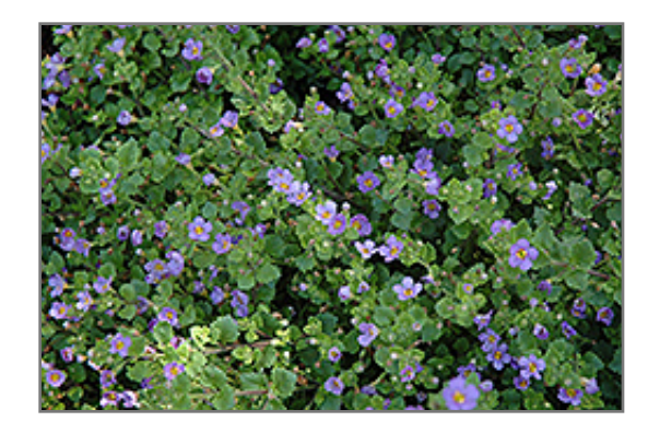
Big Falls Dark Blue Bacopa flowers

Hardiness Zone: (annual) Group/Class: Big Falls Series