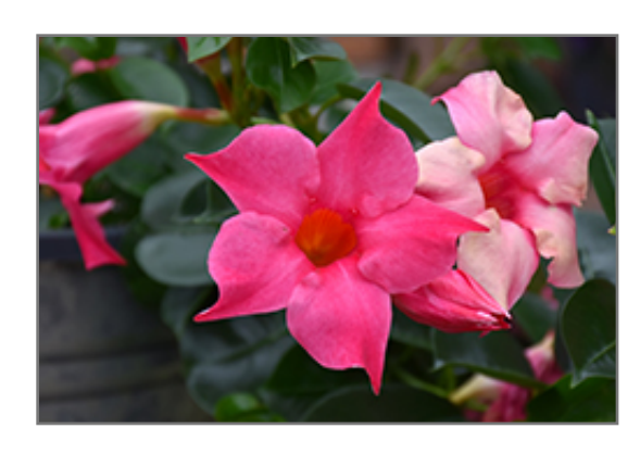
Pink Mandevilla flowers

This evergreen, twining vine produces stunning pink trumpet flowers from spring until fall; a lovely choice for trellises, garden fences or walls; prefers part shade