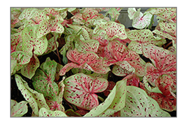
Miss Muffet Caladium foliage

Miss Muffet Caladium is recommended for the following landscape applications;