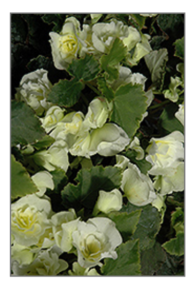
Glory White Begonia flowers

This compact, rounded variety produces dense, deep green foliage; creamy white double blooms with butter yellow centers; a great choice for light shade gardens or containers