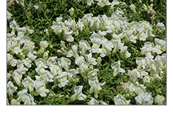
Trailing Snapshot White Snapdragon flowers

A vigorous variety producing elegant white flowers with a slight gold flare, on a low trailing habit; excellent for hanging baskets, but will also spread in garden beds; add it to a container mix