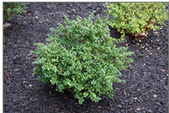
Green Lustre Japanese Holly