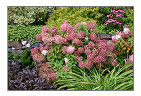
Bobo Hydrangea in bloom

This shrub performs well in both full sun and full shade. It prefers to grow in average to moist conditions, and shouldn't be allowed to dry out. It is not particular as to soil type or pH. It is highly tolerant of urban pollution and will even thrive in inner city environments. Consider applying a thick mulch around the root zone in winter to protect it in exposed locations or colder microclimates. This is a selected variety of a species not originally from North America.