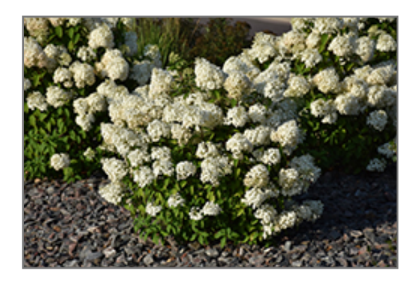
Bobo Hydrangea in bloom