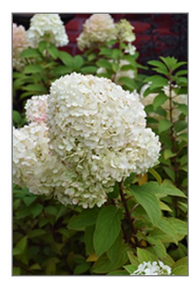
Bobo Hydrangea flowers