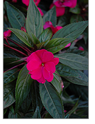
Petticoat Hot Rose New Guinea Impatiens flowers

A lovely upright mounded series featuring medium to large, colorful blooms over dark green foliage; ideal for garden beds, borders or containers; low maintenance and easy to grow; shade tolerant