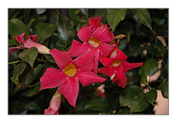
Sun Parasol Pretty Deep Pink Mandevilla flowers

This plant does best in full sun to partial shade. It requires an evenly moist well-drained soil for optimal growth. It is not particular as to soil type or pH. It is highly tolerant of urban pollution and will even thrive in inner city environments. This particular variety is an interspecific hybrid, and parts of it are known to be toxic to humans and animals, so care should be exercised in planting it around children and pets. It can be propagated by cuttings; however, as a cultivated variety, be aware that it may be subject to certain restrictions or prohibitions on propagation.