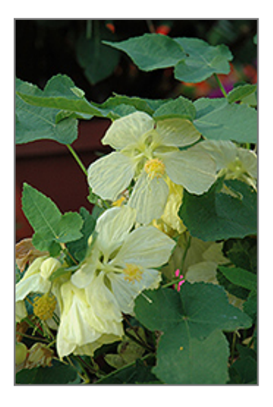
Bella Vanilla Flowering Maple flowers