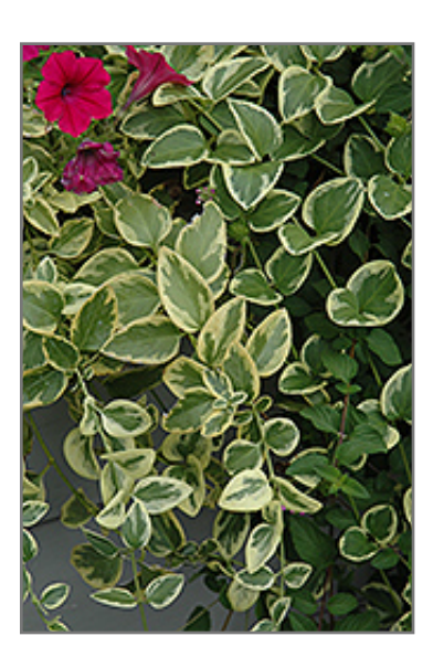
Expoflora Periwinkle foliage

Expoflora Periwinkle is recommended for the following landscape applications;