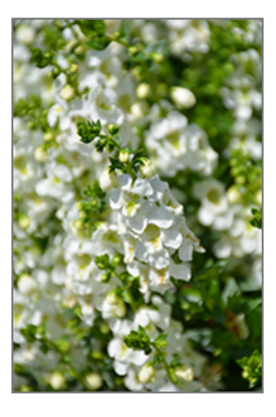
Serenita White Angelonia flowers

Serenita White Angelonia is an herbaceous annual with an upright spreading habit of growth. Its relatively fine texture sets it apart from other garden plants with less refined foliage.