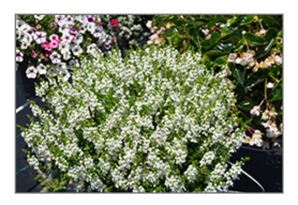
Serenita White Angelonia flowers