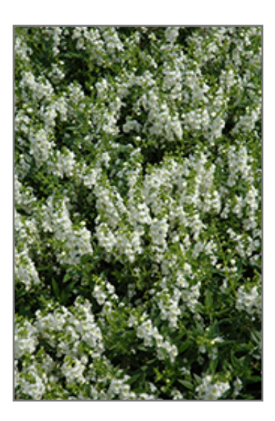
Serenita White Angelonia flowers