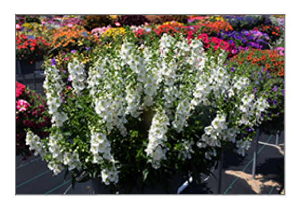
Archangel White Angelonia in bloom