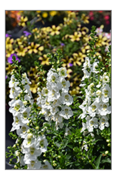
Archangel White Angelonia flowers

Archangel White Angelonia is an herbaceous annual with an upright spreading habit of growth. Its relatively fine texture sets it apart from other garden plants with less refined foliage.