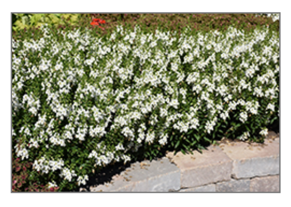
Archangel White Angelonia flowers