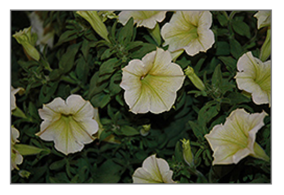
Hardiness Zone: (annual)

Height: 6 inches Spread: 12 inches Spacing: 10 inches Sunlight: O