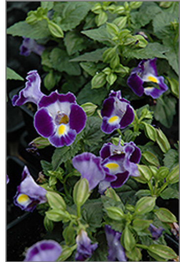
Catalina Midnight Blue Torenia flowers

Catalina Midnight Blue Torenia is recommended for the following landscape applications;