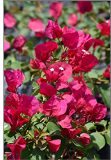
Barbara Karst Bougainvillea flowers